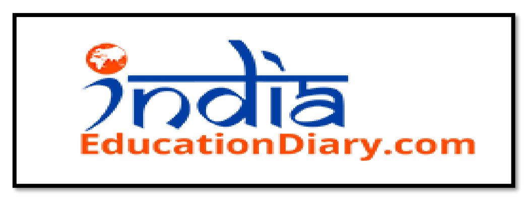
Saturday 06th July 2024