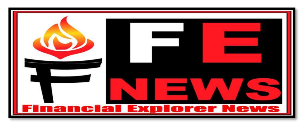
Saturday 06th July 2024

IIM Jammu concludes Fifth Batch of Capacity Building Program in Collaboration with DICCI Under the Aegis of the Ministry of Skill Development & Entrepreneurship (MSDE), Govt. of India on a Promising Note Jammu, July 05